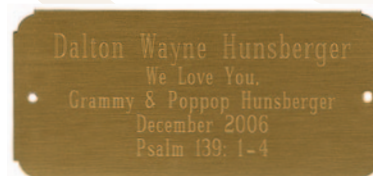
#D-14 1 3/4" x 4" Brass Plaque engraved with the message of your choice! Mounts inside of lid unless otherwise specified.