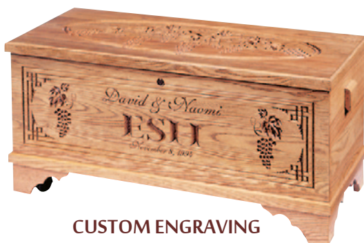
CUSTOM ENGRAVING Customize Your Chest's Front